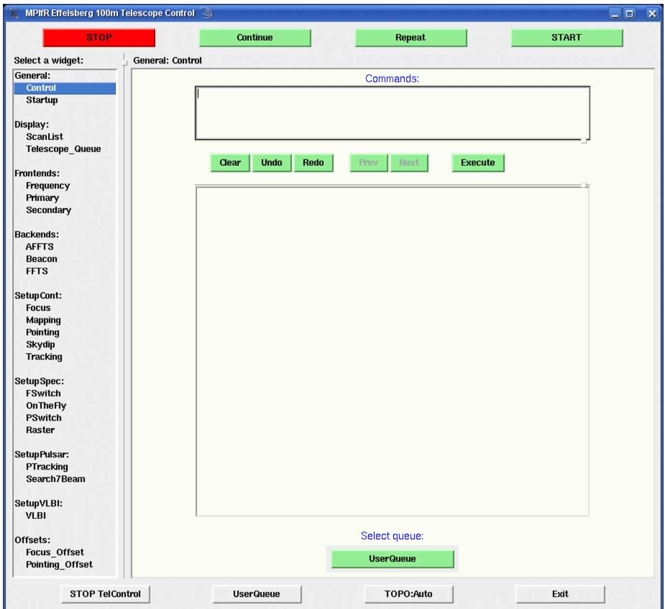
Figure 2: The Control screen allows to send commands directly to the telescope control software (take care! you have to know what you do). At the bottom the active queue can be selected.

The Startup widget is the first screen that appears when you call OBSINP and should be filled with the information that is requested: Operator, Observer, Project-Code, and the working directory. The observers directory will contain the folders for his own catalogues and scripts. The directories are called Catalogues and Scripts and will be created by the system if not already existing. The preparation of scripts is described later in the Pointing and Spectroscopy sections.