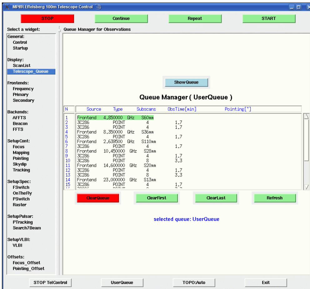
Figure 3: Top: The ScanList shows the most recent 100 scans with some basic information about observing modes and receivers used. Bottom: Example for a queue filled with pointing scans using different secondary focus receivers.

The Telescope_queue (or Queue Manager) displays the current queue and allows to shift and delete scans from the queue (Fig. 3, bottom). The current UserQueue is written as single files for each action in the /home/obseff/.SYSTEM/Queue/User directory. To prepare observations in advance or save queues for repeated observations like monitoring it is possible to save the queue-files or directory at some other place and restored it later again. For example you can write the files in a compressed tar-archive: change into the UserQueue directory and run "tar -czf ../../<dir-name>/todays_queue.tar.gz *" to save all files into your directory in todays_queue.tar.gz. "tar -xzf todays_queue.tar.gz" will extract the files in the current directory.